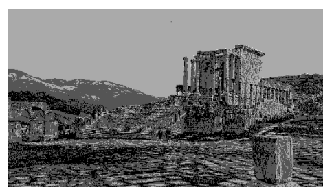
Site de Djemila